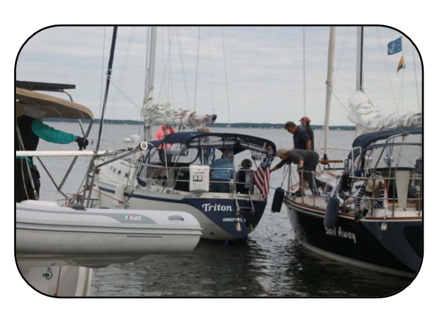
Closing the Raft