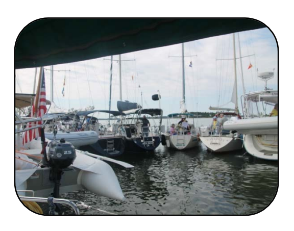
Circle Raft Little Choptank