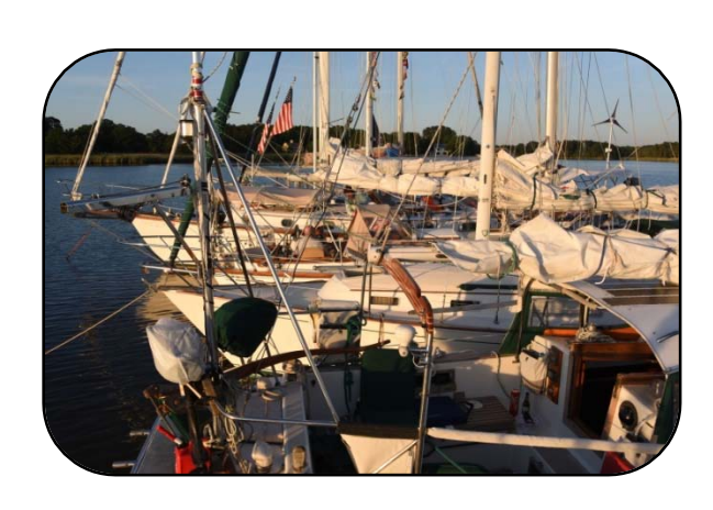
Linear raft completed!