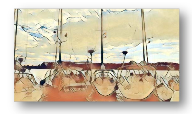
First Circle Raft of the season Special Effects by Emil Becker

For accurate information at the time you plan to go, call Tow Jamm at (410) 745-3000 and talk to the very nice lady who will discuss weather conditions based on time you plan to go. Very helpful!